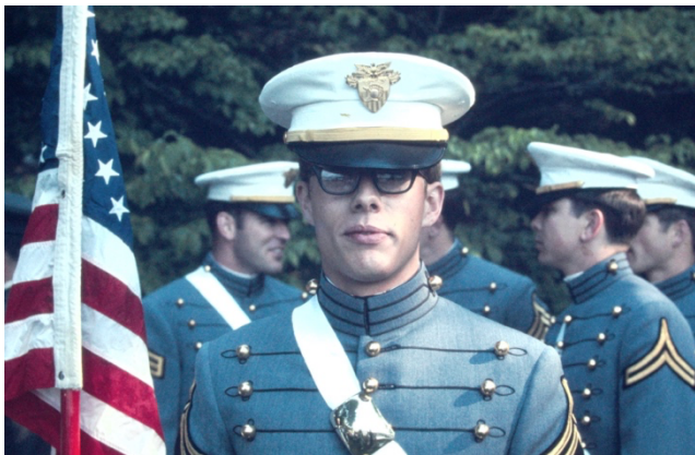
Then: As West Point Grad