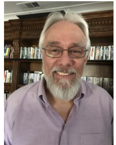
And Now: As Renaissance Society President